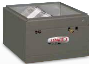
Humiditrol® Dehumidification System